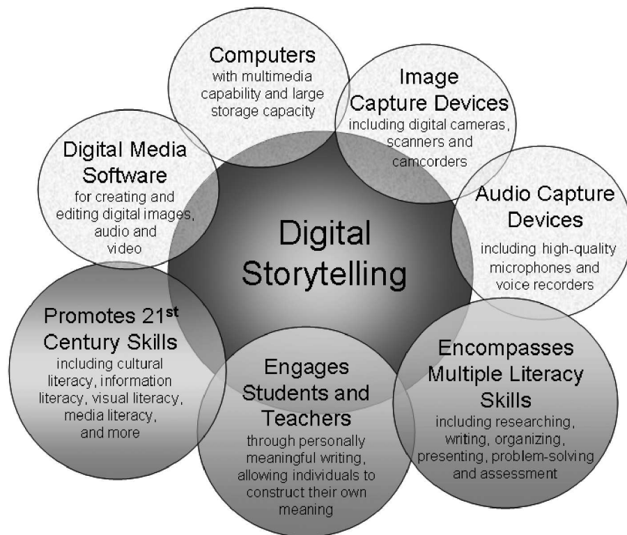
Figure 1. The convergence of digital storytelling in education.